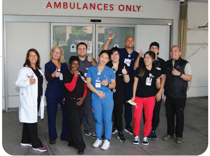
Emergency Department team members

In the heart of Arcadia, USC Arcadia Hospital's Hollfelder Emergency Care Center (HECC) stands as a beacon of hope, ready to provide urgent medical care to those in need. It is the hospital's front door, providing immediate medical care to patients seeking medical attention, whether experiencing severe injuries, acute illnesses, or other medical emergencies. USC Arcadia Hospital's HECC sees more than 45,000 patients annually, an average of 125 daily. Nearly 70 percent of all hospital admissions come through the HECC for inpatient care and specialized services, and 18 percent of emergency visits result in hospitalization.