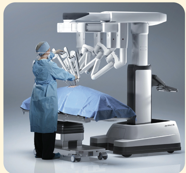
da Vinci robot

With the launch of the da Vinci robot last fall at the hospital, a surgeon will be in the operating room seated at the robotic system console. The console gives surgeons control of the instruments used to perform the surgery. The robotic system offers 3D high-definition views and offers a crystal clear view of the surgical area that is magnified 10 times to what the human eye sees. In addition, the surgeon uses tiny instruments that move like a human hand but with a far greater range of motion and with smooth precision. Surgery conducted using a da Vinci surgical robotic system is less invasive, produces shorter hospital stays, and can lead to quicker recovery times and better outcomes for patients.