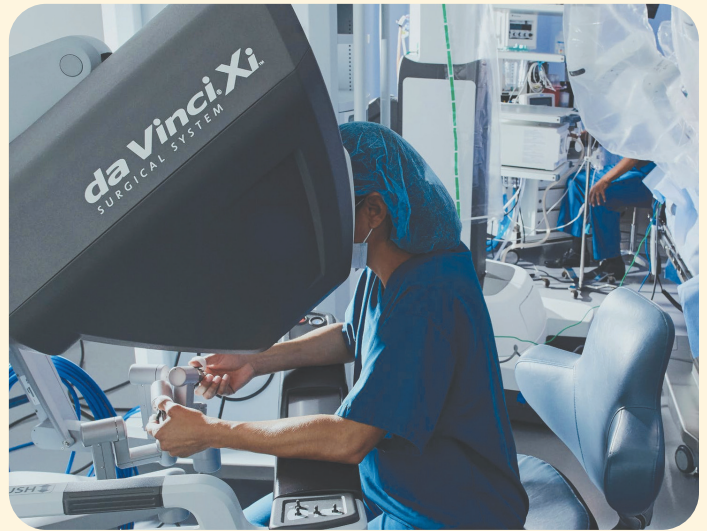
Physician using console of da Vinci robot.